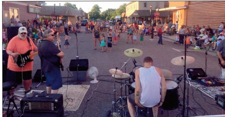
2 Miles South is one of nine bands who rocked WRJO's 15th Annual Street Dance series.